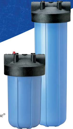
#20 Big Blue®